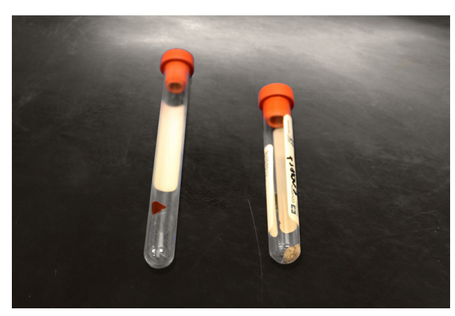
DO SUBMIT: Fresh tissue biopsy in red top tube or similar sterile container - NOT floating in saline or broth.