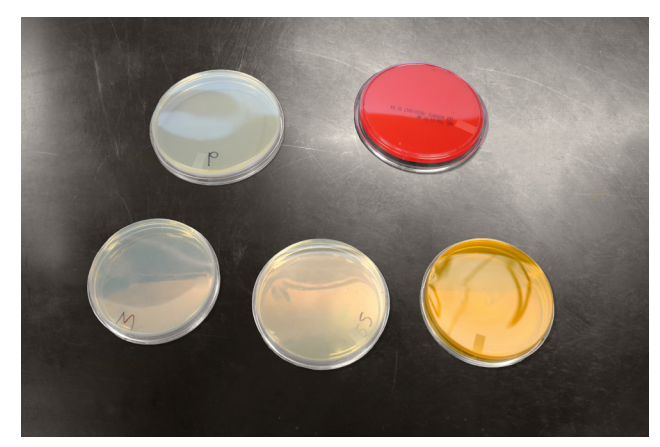
TVMDL sets up all fungal cases, including dermatophytes suspects, on multiple types of fungal culture media in order to optimize isolation.