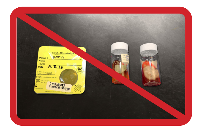
Whenever possible, submit the actual clinical specimen, as DTM plates, jars, or slants, are often non-diagnostic.