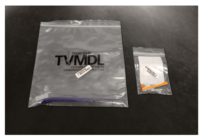
If the patient does not have discrete areas of alopecia, a toothbrush that has been brushed over the patient's body, can be submitted.