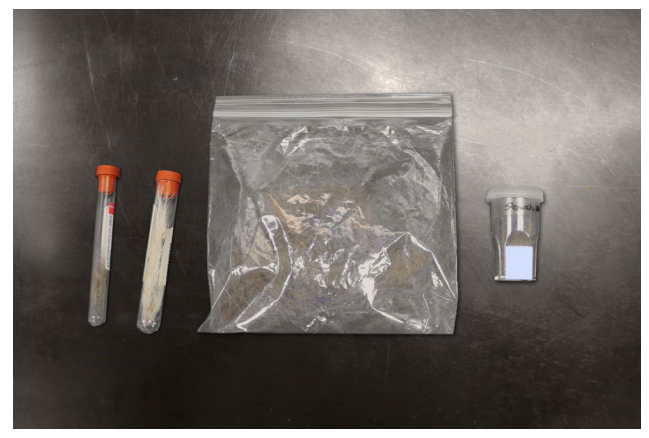
DO SUBMIT: Hair plucked from the periphery of the skin lesion and submit in a clean or sterile container not a bacterial culturette.